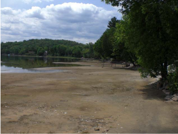
Maple Lake

Conditions in the winter and spring of 2010, outlined above, made filling the reservoir lakes, particularly on the Gull River system, very difficult. Parks Canada officials recognized the unusual conditions that were occurring early in March and moved to replace the stoplogs as quickly as possible. It had little effect because there was neither a freshet caused by the melting snowpack nor the spring rains to catch.